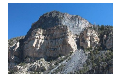
Fig. 2. Cedar Canyon

The ancient stories tell of mountains "melting like wax," an apt description for many lava fields that seem not to have flowed but only to have solidified in place. In the case of many isolated hills and mountains with basalt caps separated by drainage channels, the channel would have formed quickly while the material was still in a slurry state. Then the river of fire would have lithified the remaining slurry and melted the top [17]. There would be no millions of years while water gently rubbed away the hard basalt [17a].