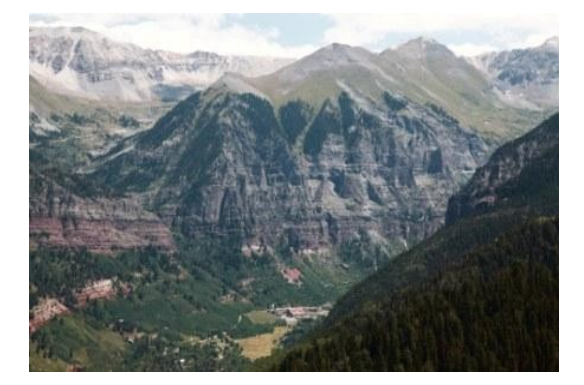
Fig. 16. Telluride, CO

The process would be fast and recent: Legends relate days of darkness, a decade for water to drain out of valleys. Dating is impossible because all methods are based on uniformist assumptions, but the cataclysm (or cataclysms) would be thousands of years ago, not millions.