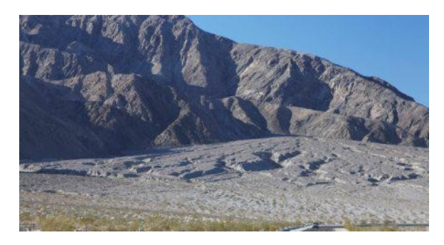
Fig. 1. Alluvial fan

Five hundredths of one percent of millions of years is hundreds of years. This figure is based on the assumption of today's rates of flow or, at worst, that of a tsunami. Under the cataclysmic conditions required by the ancient stories—the sloshing of oceans and dumps of material from space—deposition would have been much faster: decades or perhaps even months. The alluvial fans would have formed quickly and then would have been eroded by the final "trickles" of water [11].