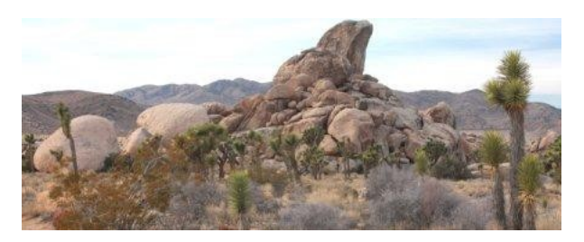
Fig. 9. Gneiss boulder heap at Joshua Tree National Park

The "pinch effect" of plasma discharges in the air (the petroglyph instabilities) could squeeze and lithify dust and sand into gravel and boulders, which would fall into the dunes or in heaps [31].