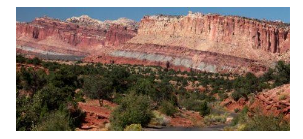
Fig. 11. Capitol Reef National Park

Material would be sorted: mechanically as in the sediment video and electrically as in the granite sample above, producing assemblies of strata of the same age [33].