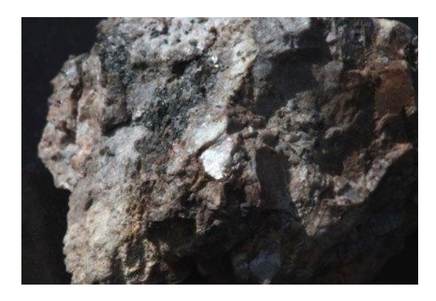
Fig. 4. "Welded" granite

ning electrical current from a welder through stream sediment. He was surprised to find that when the material in his crucibles cooled, it was indistinguishable from rocks that he saw while prospecting.