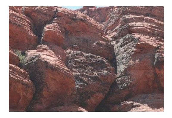
Fig. 15. Snow Canyon

Field observation suggests that the rivers of fire flowed up the drainage channels, eroding and burning obstructing faces where the channels turn [37].