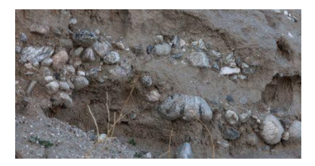
Fig. 14. Composition of Whitewater dune

Field observation suggests that the rivers of fire flowed up the drainage channels, eroding and burning obstructing faces where the channels turn [37].