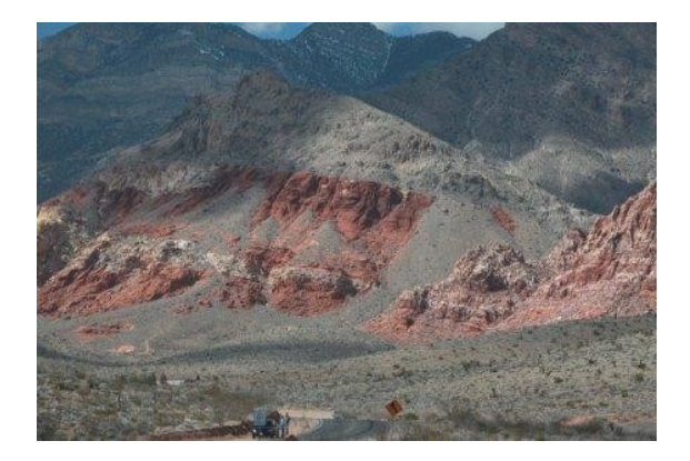
Fig. 6. Red Rock Canyon.

The standard story is that dolomite is merely limestone – calcium carbonate – with some of the calcium replaced by magnesium. The replacement occurred in ancient oceans, and then the carbonates precipitated in great quantities: The Bonanza King formation, for example, is 4500 feet thick. But <u>chemists disagree</u>: under the conditions found in seawater, magnesium will not replace the calcium [24].