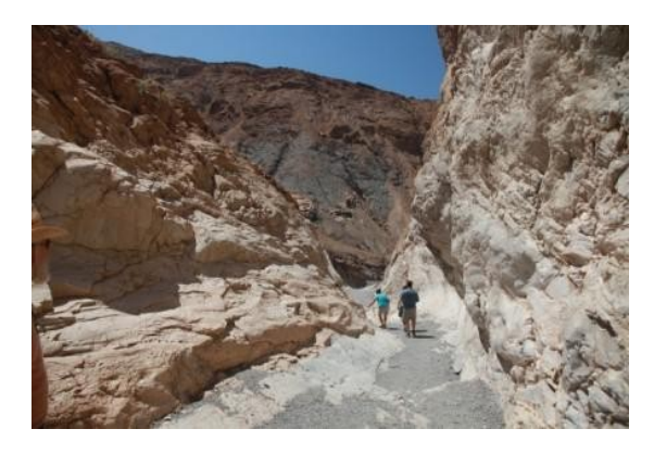
Fig. 7. Marble Canyon.

The dolomite problem gets worse: Some marble is composed of dolomite.