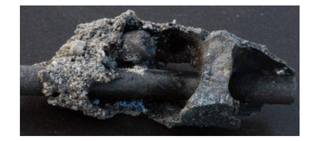
Fig. 5. "Electric" basalt.

Granite [20], basalt [21], and schist, often appeared in layers that mimicked the strata in the mountains. It occurred to him that strata, perhaps even whole mountains, could be caused electrically. He immediately dismissed the idea: Where would the welder be, the source of the current?